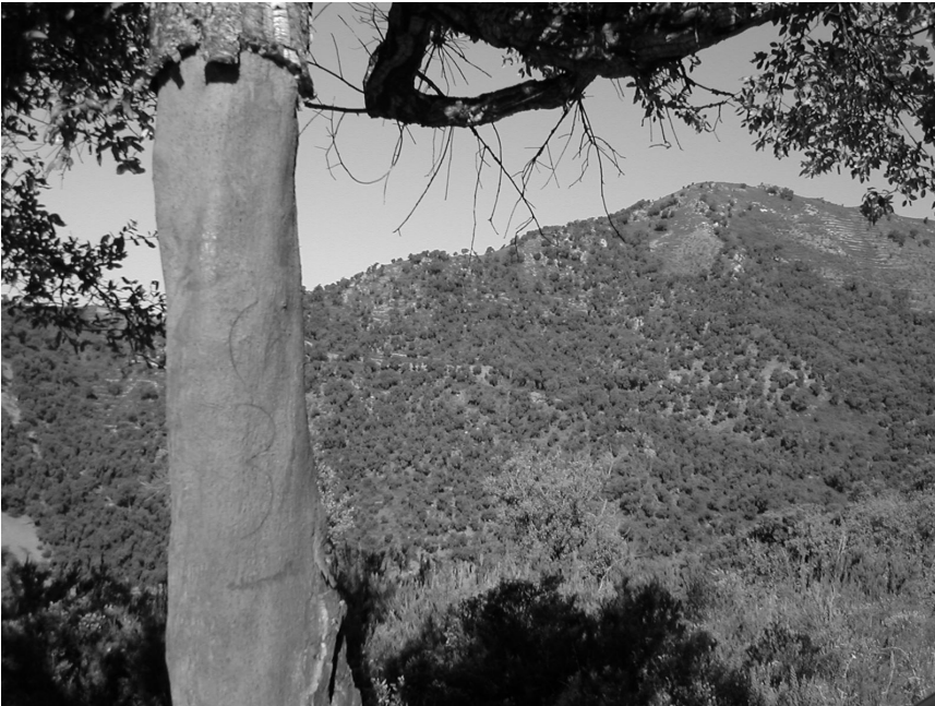
SITE PROFILE FIGURE 8.1. Espadà cork oak forest (eastern Spain).